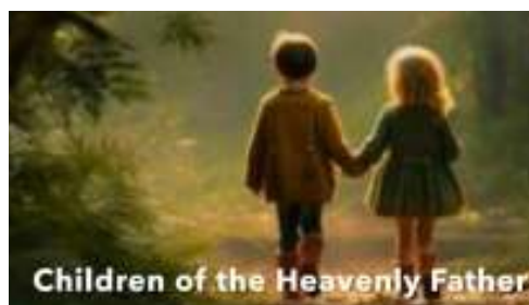
Children of the Heavenly Father